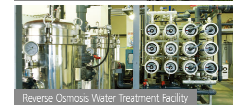
Reverse Osmosis Water Treatment Facility