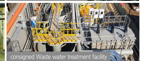
consigned Waste water treatment facility