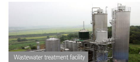
Wastewater treatment facility