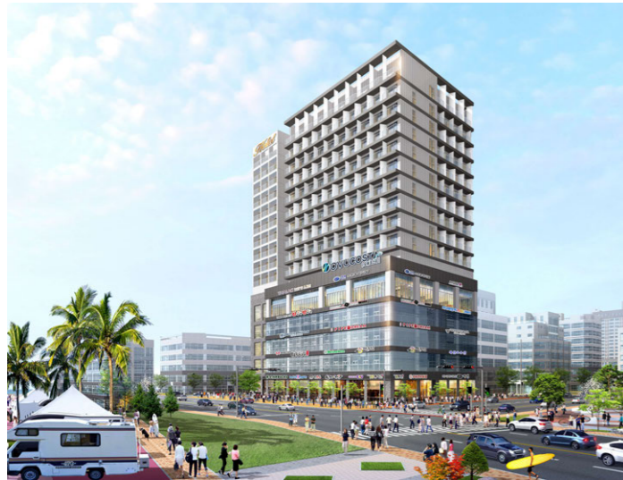
OVU COSTA (오부 코스타)