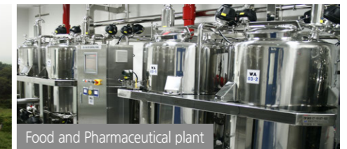
Food and Pharmaceutical plant