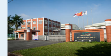
WELCRON Ho Chi Minh Office