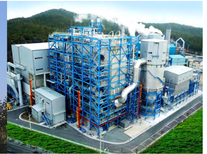
Daesan Power co.,LTD heat supplying facility construction work