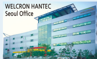
WELCRON HANTEC Seoul Office