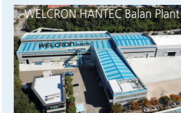
WELCRON HANTEC Balan Plant