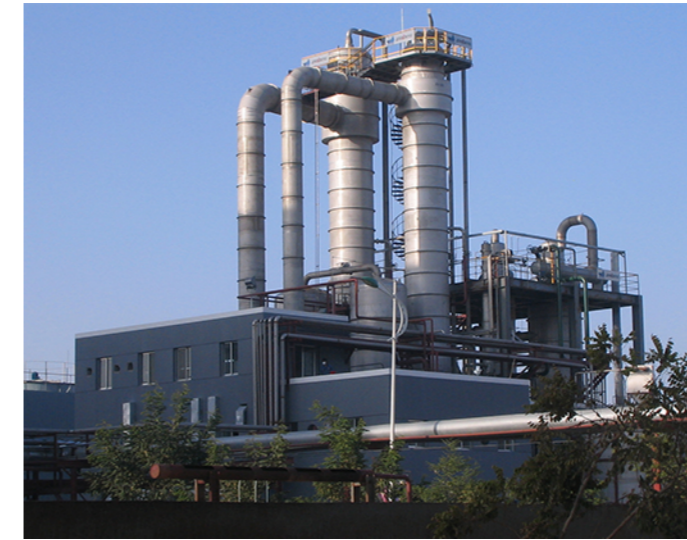
MVR evaporation Facility