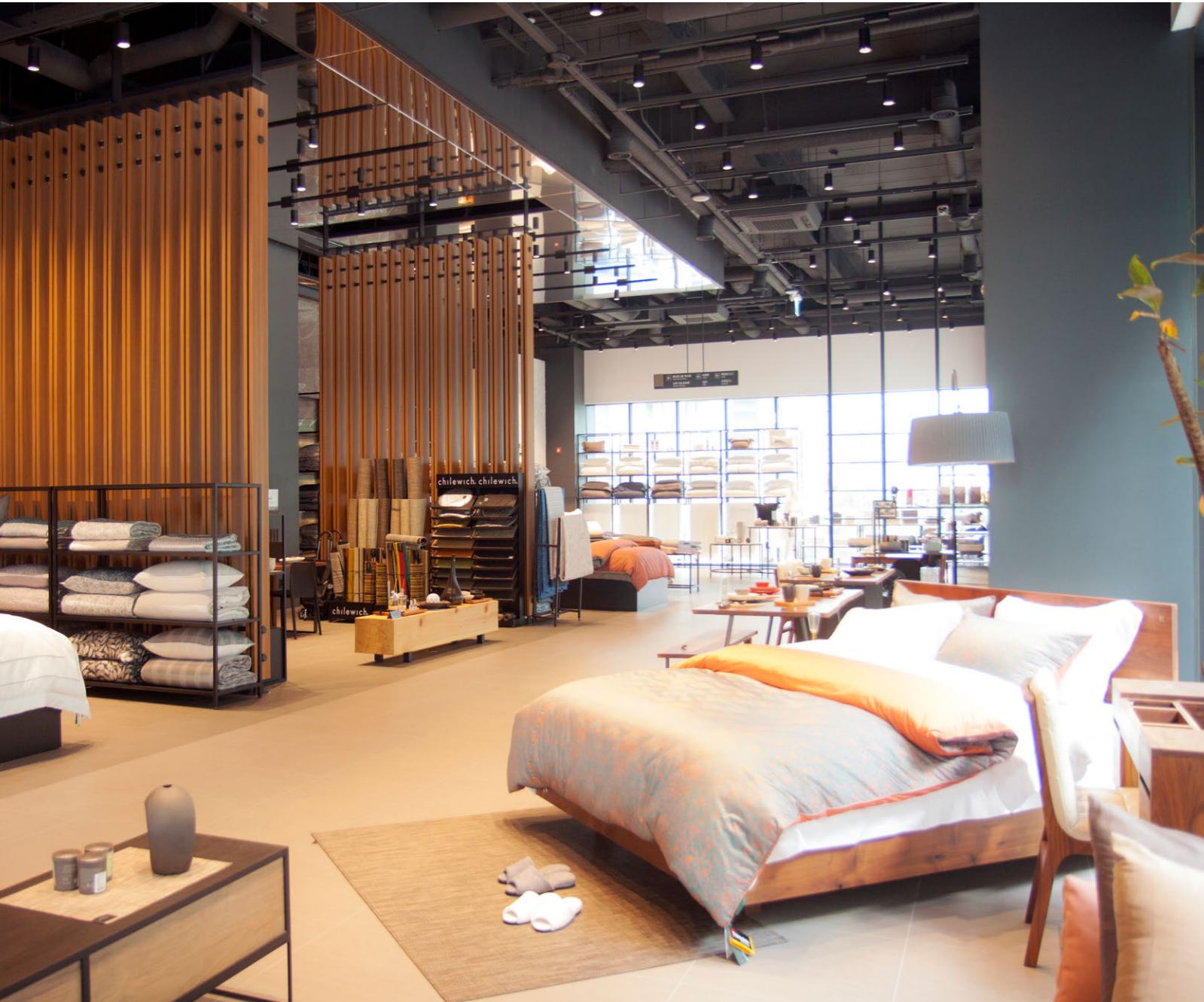
WELCRON Flagship Store SESA EDITION