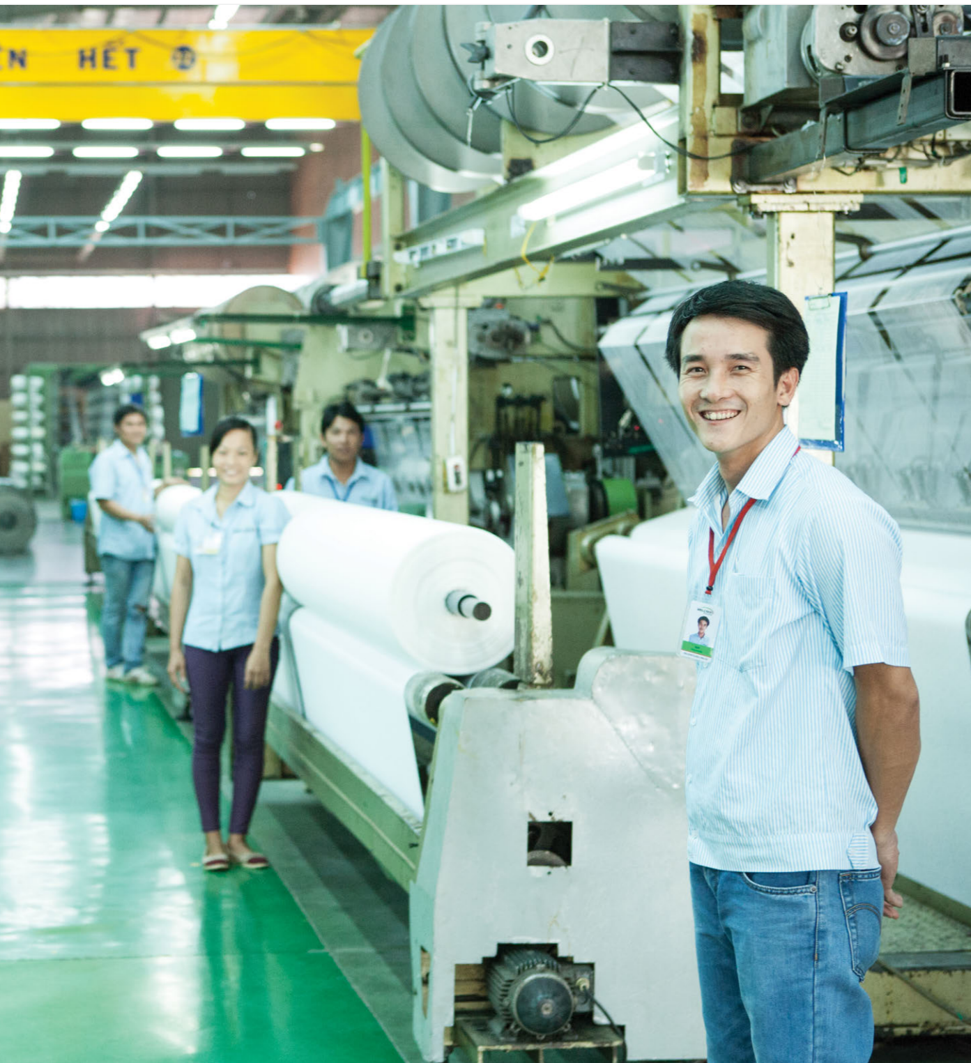
WELCRON GLOBAL VINA Manufacturing facility